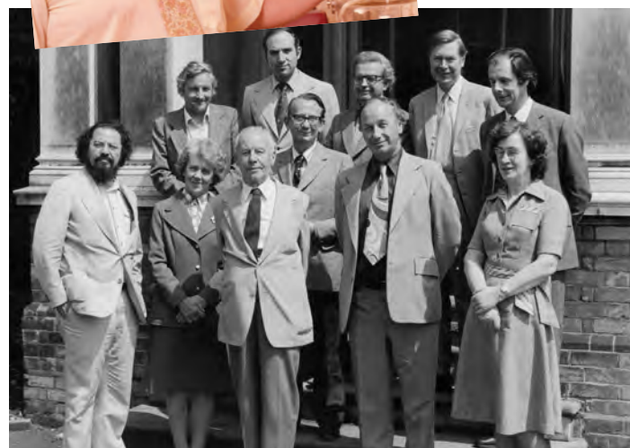
Sir John Vane (front row, second from right) with colleagues outside his office in Beckenham, mid 1970s'