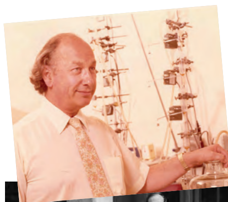
Sir John Vane in his lab at the Wellcome Research Laboratories in Beckenham, 1982